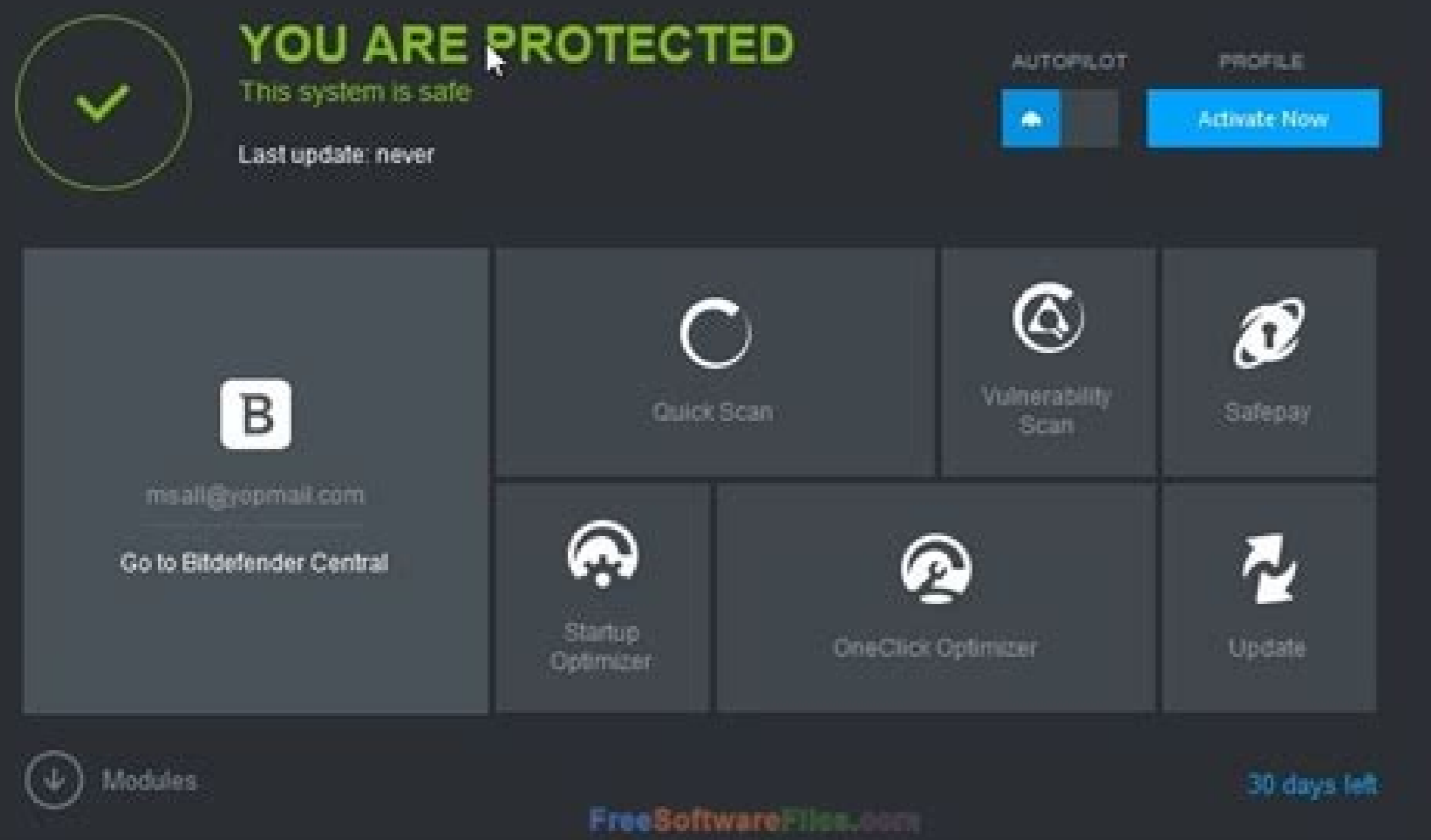
Bitdefender total security 2018 offline installer. Best bitdefender. Download bitdefender total security 2018 offline installer. Bitdefender 2018 offline installer.